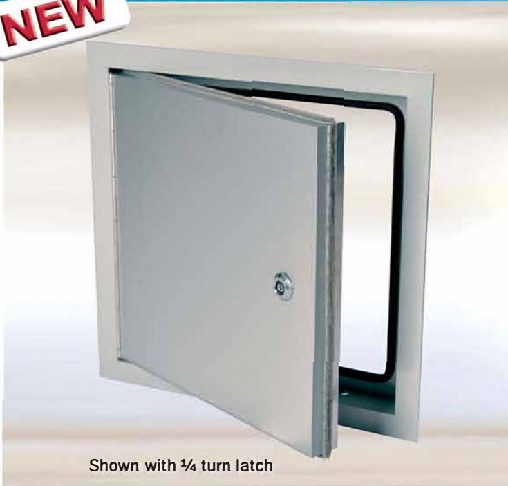
Shown with ¼ turn latch